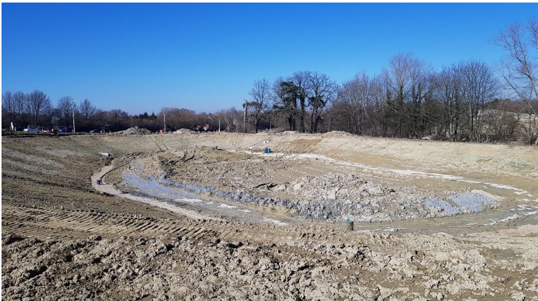
Finished earthworks for the first balancing pond

In addition, earthworks for the new slip roads for junction 10a has also started