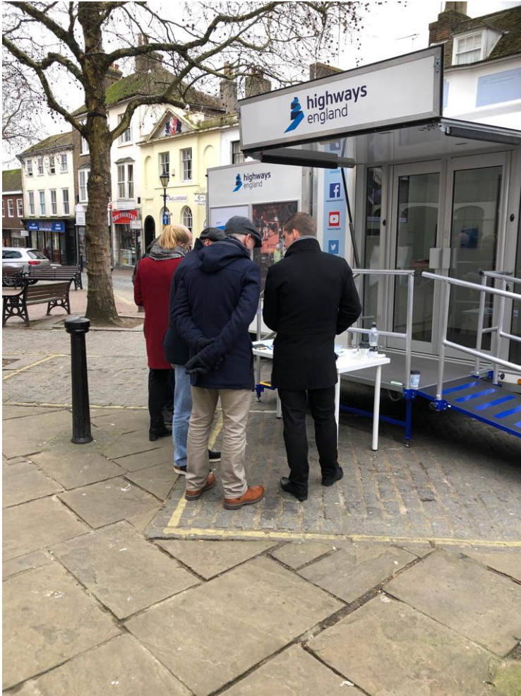
The Highways England Mobile Engagement Van on Ashford High Street