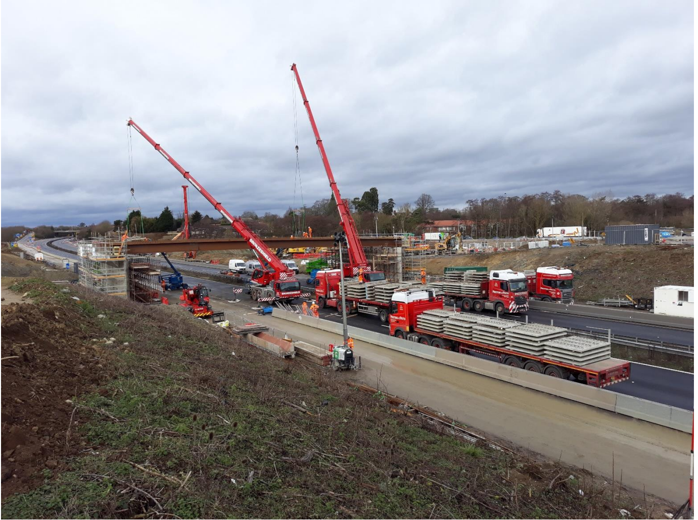
West Interchange Bridge Installation (25-28 th January 2019)